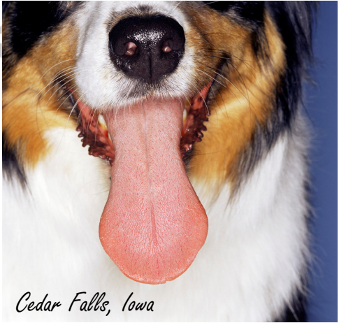
Cedar Falls, Iowa

Paw Park is a municipal park located on South Main Street just south of Nazareth Lutheran Church and the Highway 58 overpass. The park is a fenced in, off-leash exercise facility for dogs.